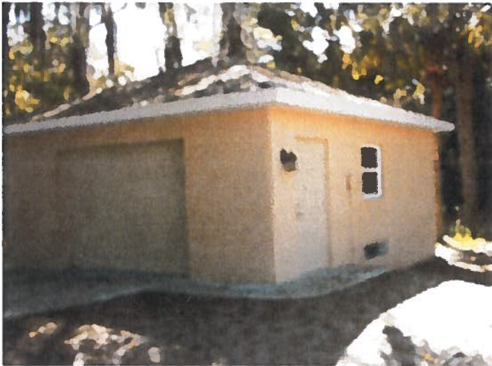
FRONT VIEW 3/16/09

If using the Elevation Certificate to obtain NFIP flood insurance, affix at least two building photographs below according to the instructions for Item A6. Identify all photographs with: date taken; "Front View" and "Rear View"; and, if required, "Right Side View" and "Left Side View." If submitting more photographs than will fit on this page, use the Continuation Page, following.