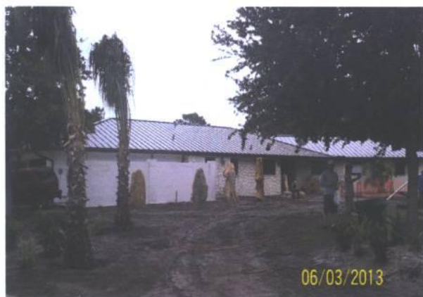
FRONT VIEW 6-3-13

If using the Elevation Certificate to obtain NFIP flood insurance, affix at least 2 building photographs below according to the instructions for Item A6. Identify all photographs with date taken; "Front View" and "Rear View"; and, if required, "Right Side View" and "Left Side View." When applicable, photographs must show the foundation with representative examples of the flood openings or vents, as indicated in Section A8. If submitting more photographs than will fit on this page, use the Continuation Page.