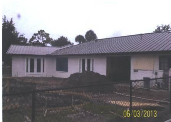
REAR VIEW 6-3-13