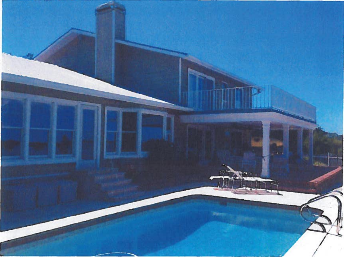
BACK OF HOUSE 05-07-15

If submitting more photographs than will fit on the preceding page, affix the additional photographs below. Identify all photographs with: date taken; "Front View" and "Rear View"; and, if required, "Right Side View" and "Left Side View." When applicable, photographs must show the foundation with representative examples of the flood openings or vents, as indicated in Section A8.