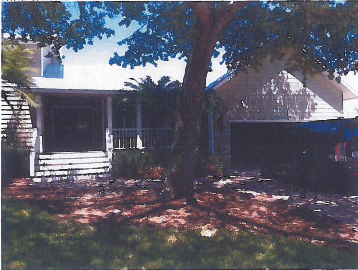
FRONT OF HOUSE 05-07-15

If using the Elevation Certificate to obtain NFIP flood insurance, affix at least 2 building photographs below according to the instructions for item A6. Identify all photographs with date taken; "Front View" and "Rear View"; and, if required, "Right Side View" and "Left Side View." When applicable, photographs must show the foundation with representative examples of the flood openings or vents, as indicated in Section A8. If submitting more photographs than will fit on this page, use the Continuation Page.