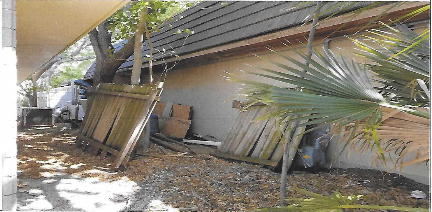
Photo One Caption 5132 OCEAN BOULEVARD - SIDE PHOTO

If submitting more photographs than will fit on the preceding page, affix the additional photographs below. Identify all photographs with: date taken; "Front View" and "Rear View"; and, if required, "Right Side View" and "Left Side View." When applicable, photographs must show the foundation with representative examples of the flood openings or vents, as indicated in Section A8.