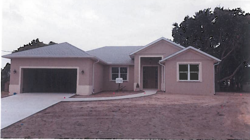
FRONT VIEW 4/17/15

If using the Elevation Certificate to obtain NFIP flood insurance, affix at least 2 building photographs below according to the instructions for Item A6. Identify all photographs with date taken; "Front View" and "Rear View"; and, if required, "Right Side View" and "Left Side View." When applicable, photographs must show the foundation with representative examples of the flood openings or vents, as indicated in Section A8. If submitting more photographs than will fit on this page, use the Continuation Page.