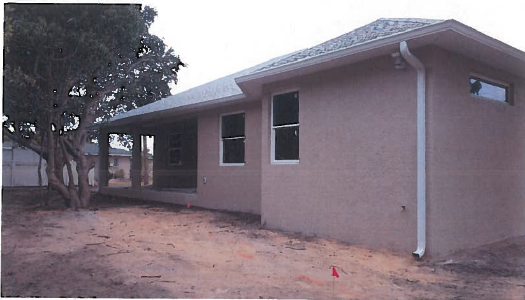
REAR VIEW 4/17/15