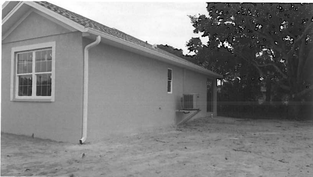
RIGHT SIDE 4/17/15