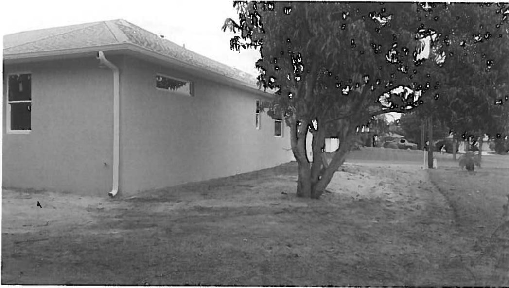
LEFT SIDE 4/17/15

If submitting more photographs than will fit on the preceding page, affix the additional photographs below. Identify all photographs with: date taken; "Front View" and "Rear View"; and, if required, "Right Side View" and "Left Side View." When applicable, photographs must show the foundation with representative examples of the flood openings or vents, as indicated in Section A8.