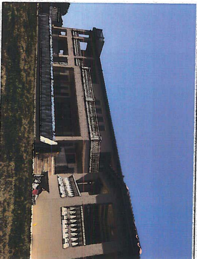
REAR VIEW 06/24/2019