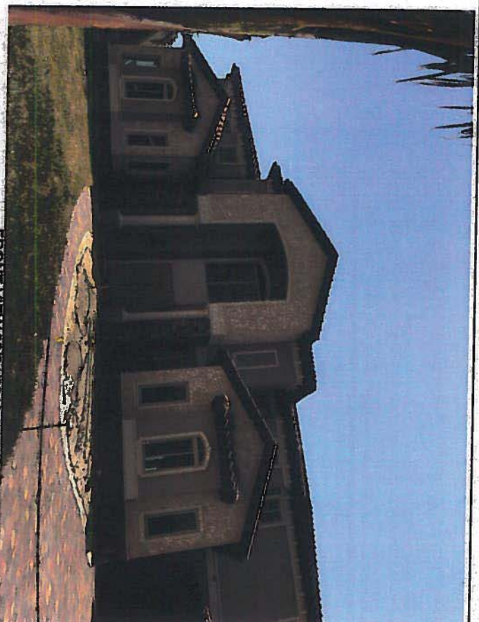
FRONT VIEW 06/24/2019

If using the Elevation Certificate to obtain NFIP flood insurance, affix at least 2 building photographs below according to the instructions for Item A6. Identify all photographs with date taken; "Front View" and "Rear View"; and, if required, "Right Side View" and "Left Side View." When applicable, photographs must show the foundation with representative examples of the flood openings or vents, as indicated in Section A6. If submitting more photographs than will fit on this page, use the Continuation Page.