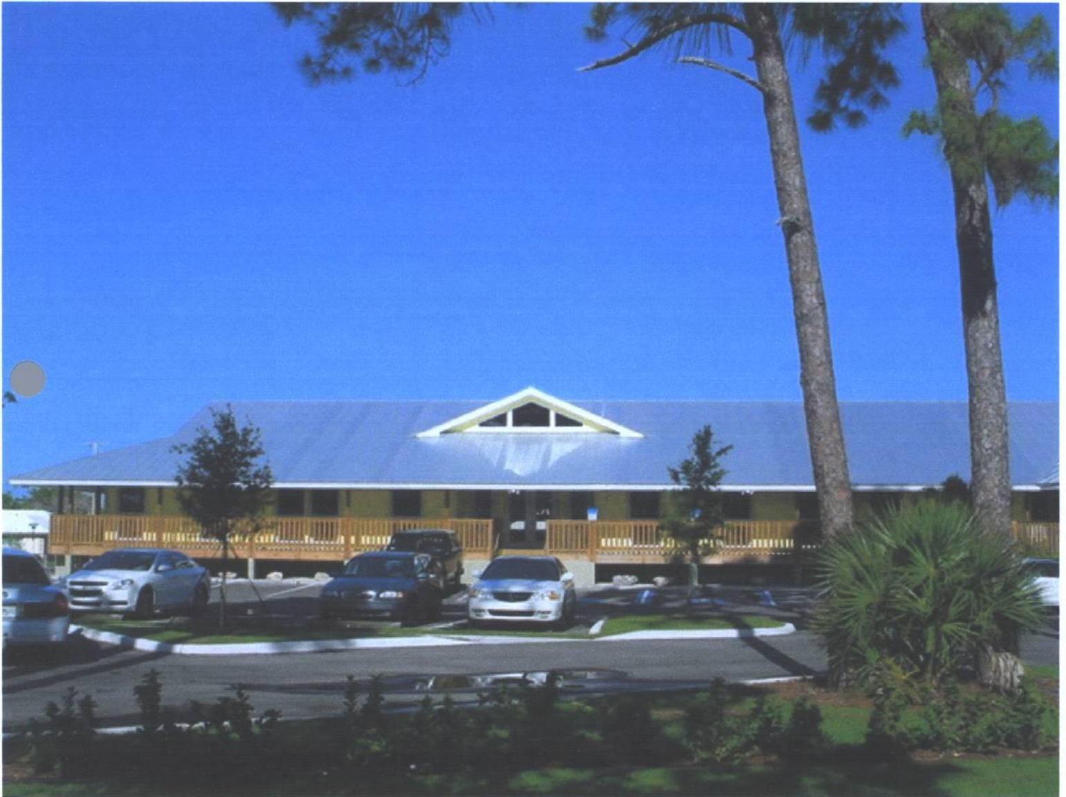
Front View 4-24-08