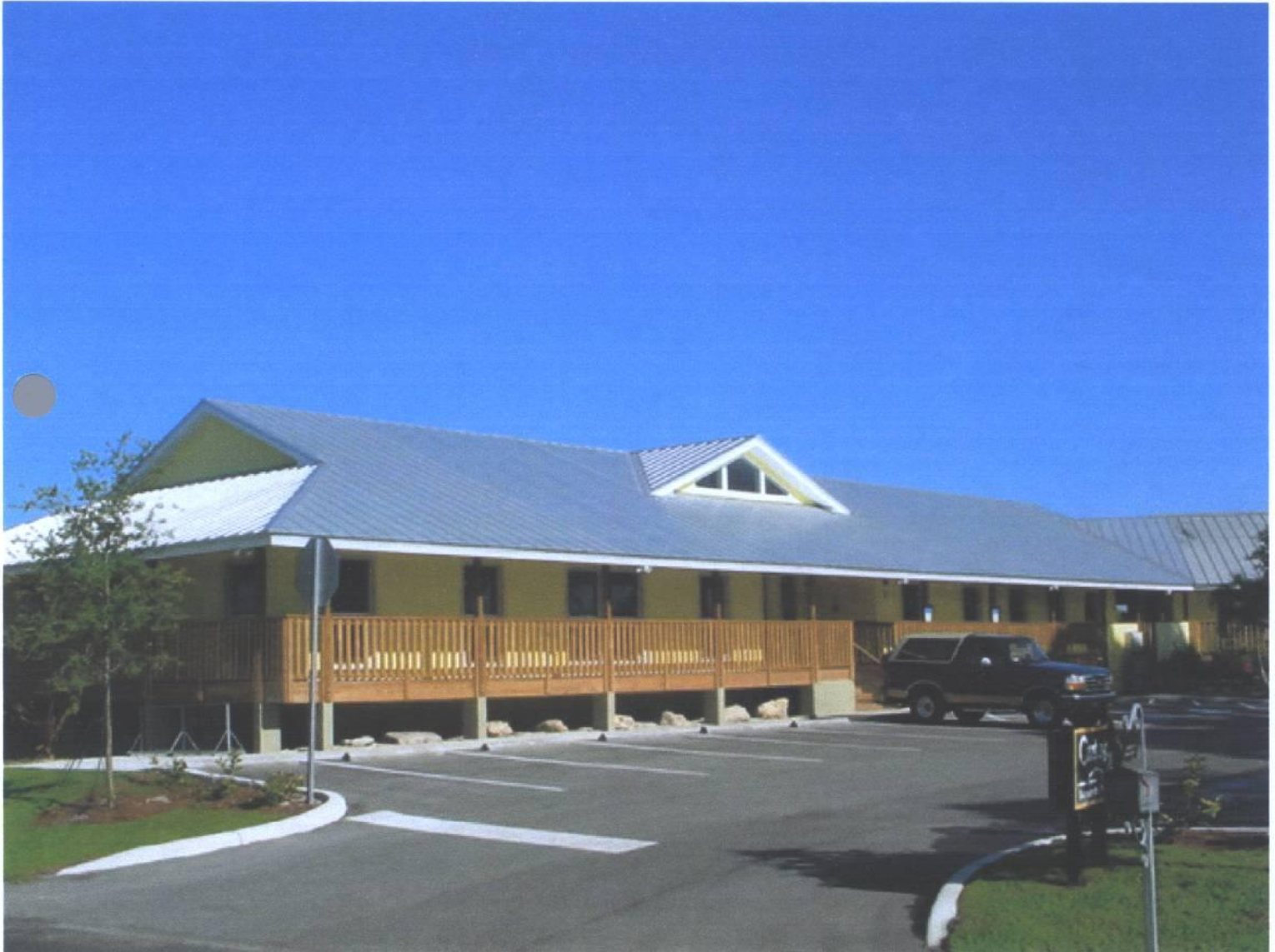
Front Left View 4-24-08

If using the Elevation Certificate to obtain NFIP flood insurance, affix at least two building photographs below according to the instructions for Item A6. Identify all photographs with: date taken; "Front View" and "Rear View"; and, if required, "Right Side View" and "Left Side View." If submitting more photographs than will fit on this page, use the Continuation Page, following.