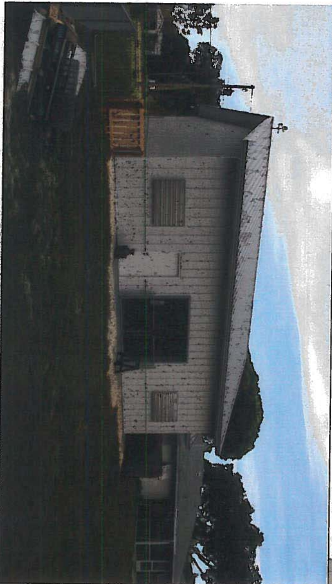
REAR VIEW 05/10/2018