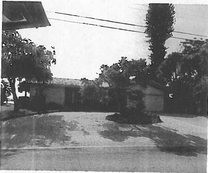
FRONT VIEW 8-19-14

If using the Elevation Certificate to obtain NFIP flood insurance, affix at least 2 building photographs below according to the instructions for Item A6. Identify all photographs with date taken; "Front View" and "Rear View"; and, if required, "Right Side View" and "Left Side View." When applicable, photographs must show the foundation with representative examples of the flood openings or vents, as indicated in Section A8. If submitting more photographs than will fit on this page, use the Continuation Page.