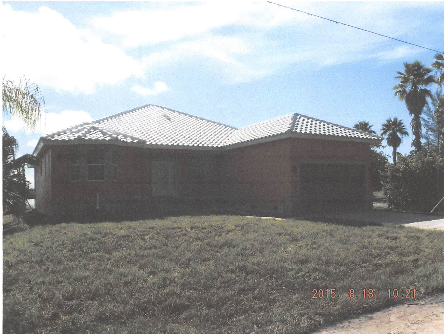
Front View and Left Side View

If using the Elevation Certificate to obtain NFIP flood insurance, affix at least 2 building photographs below according to the instructions for Item A6. Identify all photographs with date taken; "Front View" and "Rear View"; and, if required, "Right Side View" and "Left Side View". When applicable, photographs must show the foundation with representative examples of the flood openings or vents, as indicated in Section A8. If submitting more photographs than will fit on this page, use the Continuation Page.