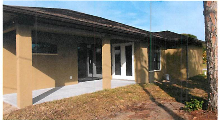
REAR VIEW 6/4/14