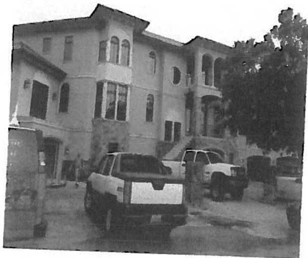
FRONT VIEW 9-23-2013

If using the Elevation Certificate to obtain NFIP flood insurance, affix at least 2 building photographs below according to the instructions for Item A6. Identify all photographs with date taken; "Front View" and "Rear View"; and, if required, "Right Side View" and "Left Side View." When applicable, photographs must show the foundation with representative examples of the flood openings or vents, as indicated in Section A8. If submitting more photographs than will fit on this page, use the Continuation Page.