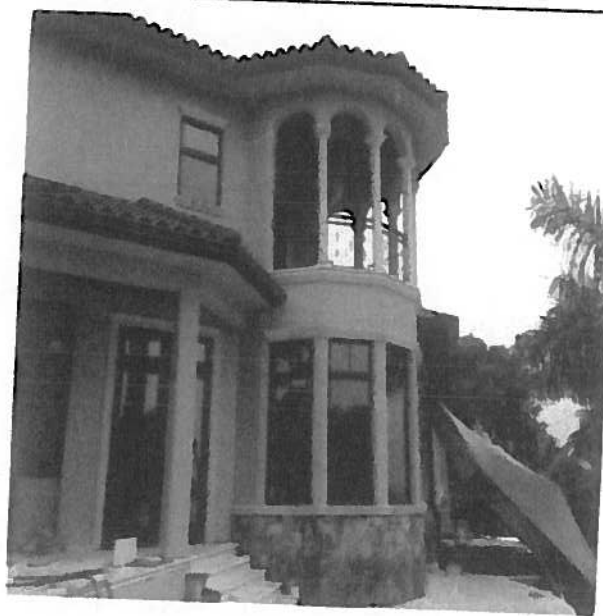
REAR VIEW 9-23-2013