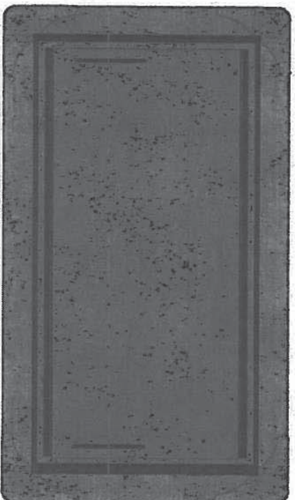
FIGURE 2—SMART VENT MODEL 1540-520