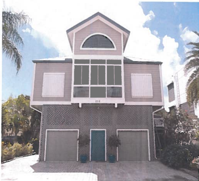
FRONT VIEW 10-1-14

If using the Elevation Certificate to obtain NFIP flood insurance, affix at least 2 building photographs below according to the instructions for Item A6. Identify all photographs with date taken; "Front View" and "Rear View"; and, if required, "Right Side View" and "Left Side View." When applicable, photographs must show the foundation with representative examples of the flood openings or vents, as indicated in Section A8. If submitting more photographs than will fit on this page, use the Continuation Page.