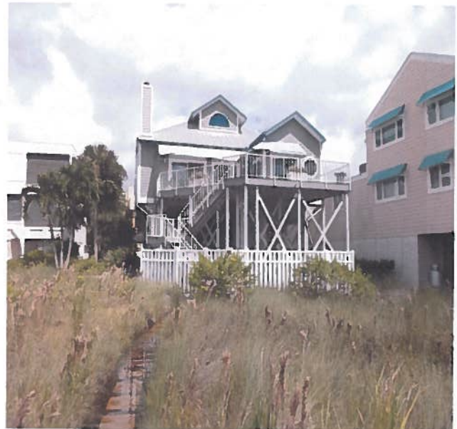
REAR VIEW 10-1-14