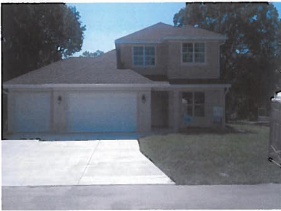
FRONT VIEW 10-11-12

If using the Elevation Certificate to obtain NFIP flood insurance, affix at least two building photographs below according to the instructions for Item A6. Identify all photographs with: date taken; "Front View" and "Rear View"; and, if required, "Right Side View" and "Left Side View." If submitting more photographs than will fit on this page, use the Continuation Page on the reverse.