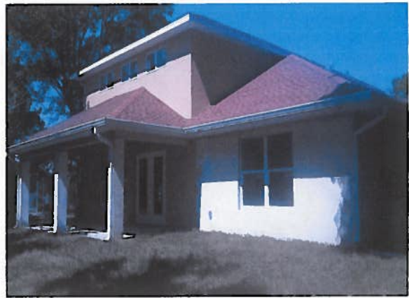
REAR VIEW 10-11-12