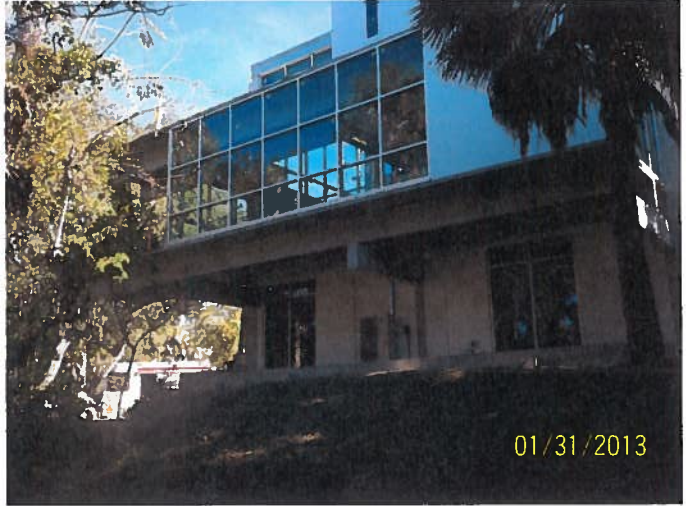
REAR VIEW 1/31/13