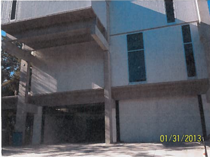
FRONT VIEW 1/31/13

If using the Elevation Certificate to obtain NFIP flood insurance, affix at least 2 building photographs below according to the instructions for Item A6. Identify all photographs with date taken; "Front View" and "Rear View"; and, if required, "Right Side View" and "Left Side View." When applicable, photographs must show the foundation with representative examples of the flood openings or vents, as indicated in Section A8. If submitting more photographs than will fit on this page, use the Continuation Page.