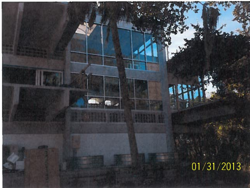
SIDE VIEW 1/31/13