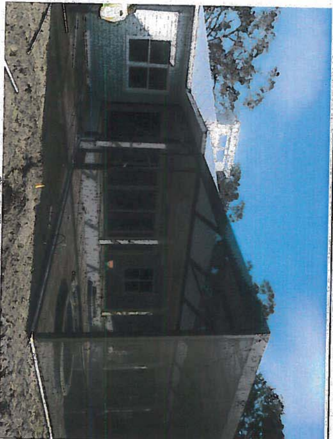
REAR VIEW 12/06/17