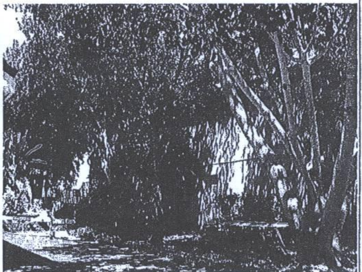
Left Property Picture