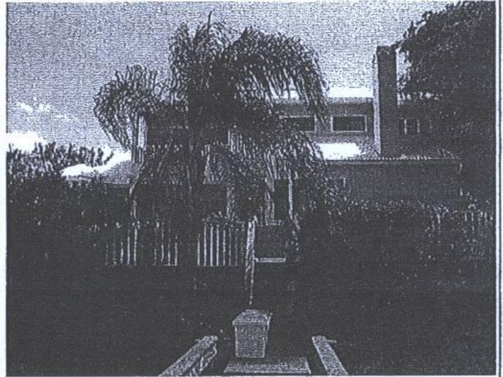
Rear Property Picture 5/17/2011