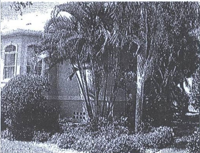
Right Property Picture