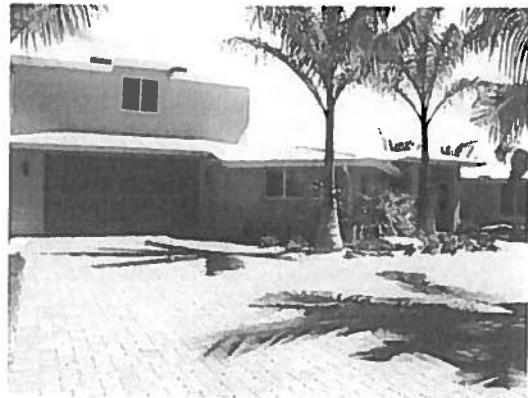
FRONT VIEW 9-29-10