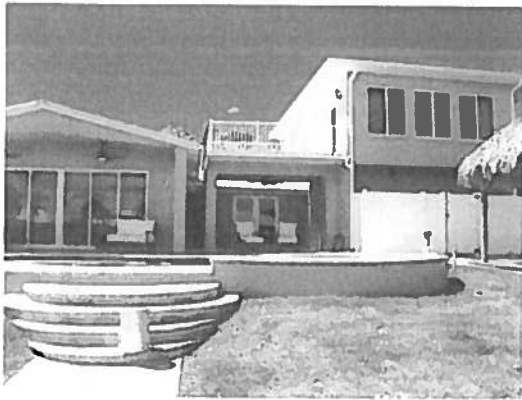
REAR VIEW 9-29-10