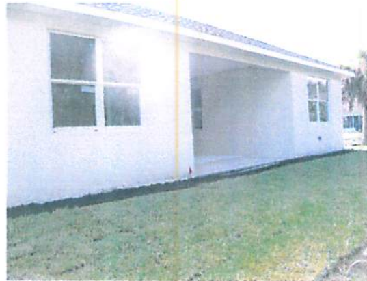
REAR VIEW 9-12-12