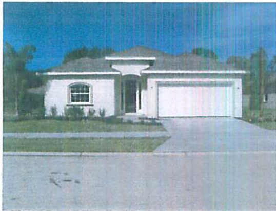
FRONT VIEW 9-12-12