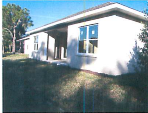
REAR VIEW 12-19-11