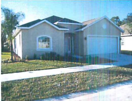
FRONT VIEW 12-19-11