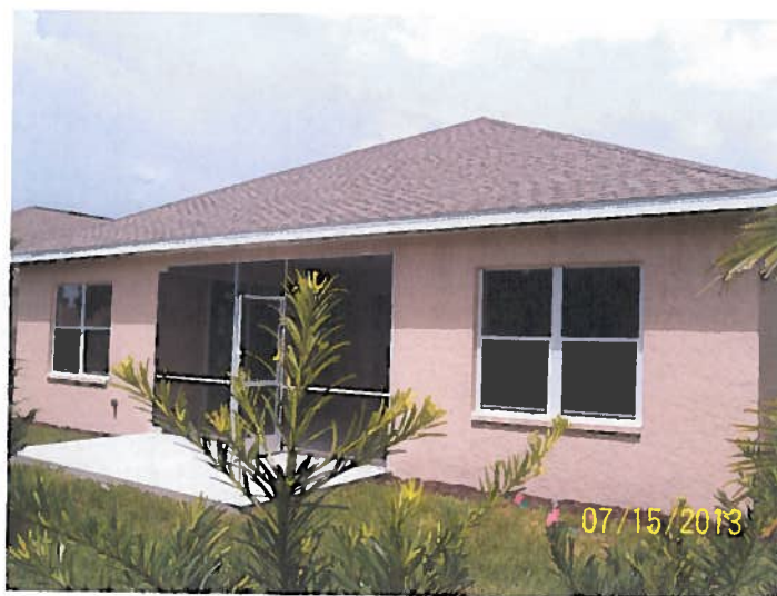
REAR VIEW 7/15/13