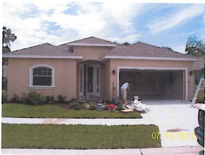
FRONT VIEW 7/15/13

If using the Elevation Certificate to obtain NFIP flood insurance, affix at least 2 building photographs below according to the instructions for Item A6. Identify all photographs with date taken; "Front View" and "Rear View"; and, if required, "Right Side View" and "Left Side View." When applicable, photographs must show the foundation with representative examples of the flood openings or vents, as indicated in Section A8. If submitting more photographs than will fit on this page, use the Continuation Page.