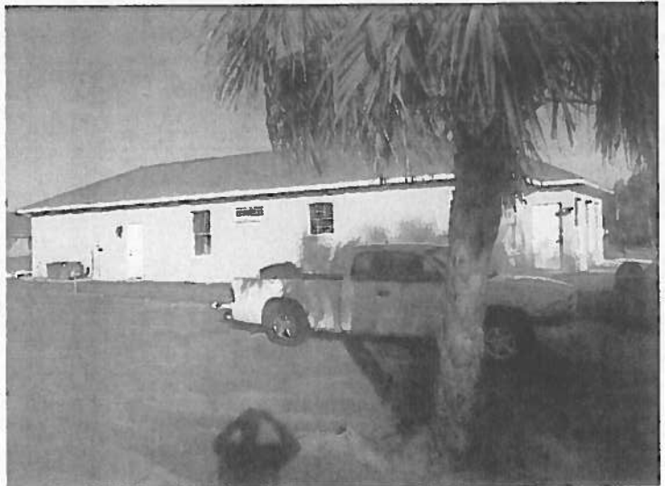
REAR VIEW 2-10-10