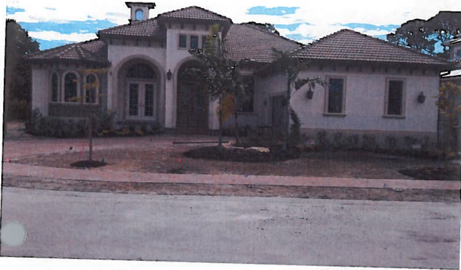
Rear of House: