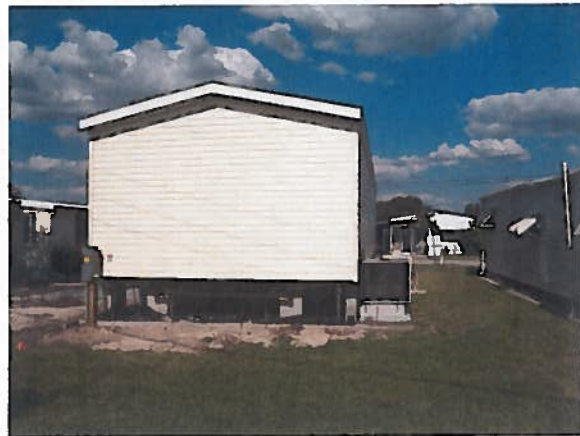
REAR VIEW 10-11-10