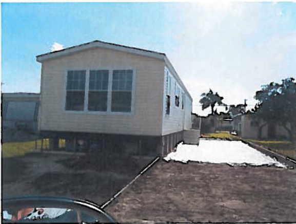
FRONT VIEW 10-11-10

If using the Elevation Certificate to obtain NFIP flood insurance, affix at least two building photographs below according to the instructions for Item A6. Identify all photographs with: date taken; "Front View" and "Rear View"; and, if required, "Right Side View" and "Left Side View." If submitting more photographs than will fit on this page, use the Continuation Page on the reverse.