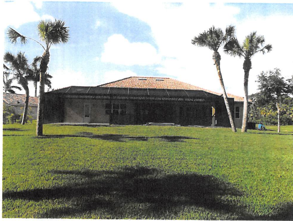
REAR VIEW 7/12/16