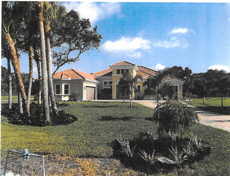
FRONT VIEW 7/12/16

If using the Elevation Certificate to obtain NFIP flood insurance, affix at least 2 building photographs below according to the instructions for Item A6. Identify all photographs with date taken; "Front view" and "Rear view"; and, if required, "Right Side View" and "Left Side View." When applicable, photographs must show the foundation with representative examples of the flood openings or vents, as indicated in Section A8. If submitting more photographs than will fit on this page, use the Continuation Page.