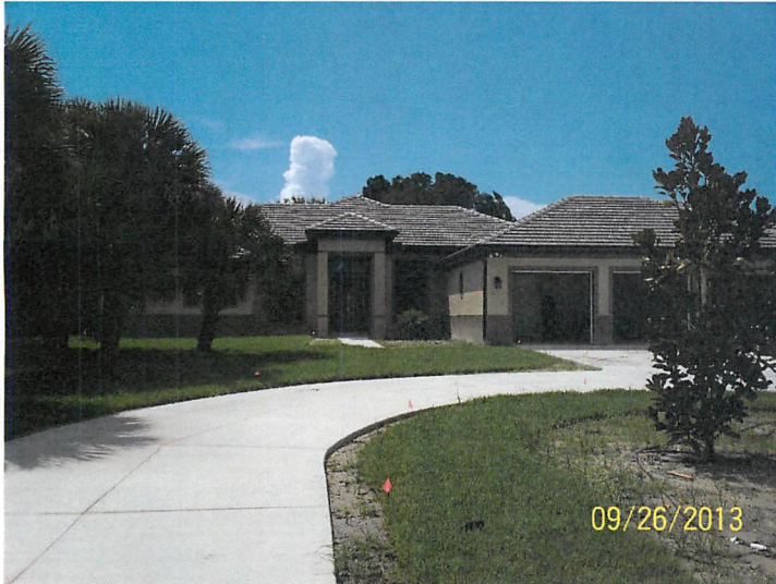
FRONT VIEW 9/26/13

If using the Elevation Certificate to obtain NFIP flood insurance, affix at least 2 building photographs below according to the instructions for Item A6. Identify all photographs with date taken; "Front View" and "Rear View"; and, if required, "Right Side View" and "Left Side View." When applicable, photographs must show the foundation with representative examples of the flood openings or vents, as indicated in Section A8. If submitting more photographs than will fit on this page, use the Continuation Page.