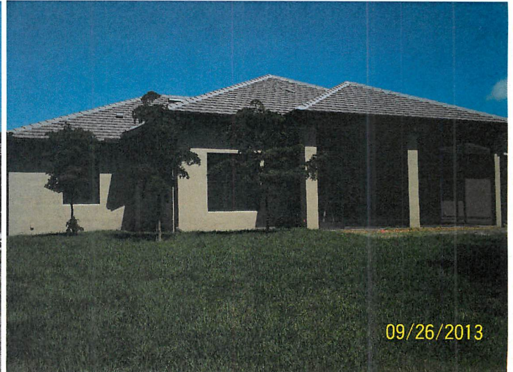
REAR VIEW 9/26/13