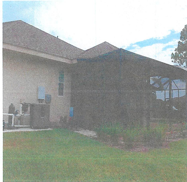
REAR VIEW 8-16-2013