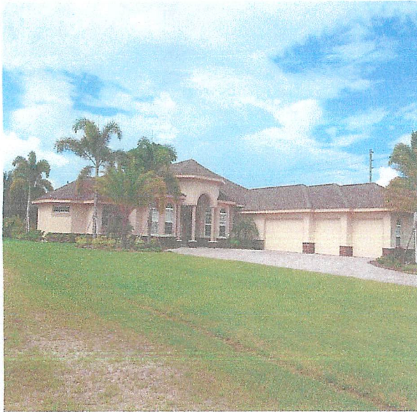
FRONT VIEW 8-16-2013

If using the Elevation Certificate to obtain NFIP flood insurance, affix at least 2 building photographs below according to the instructions for Item A6. Identify all photographs with date taken; "Front View" and "Rear View"; and, if required, "Right Side View" and "Left Side View." When applicable, photographs must show the foundation with representative examples of the flood openings or vents, as indicated in Section A8. If submitting more photographs than will fit on this page, use the Continuation Page.