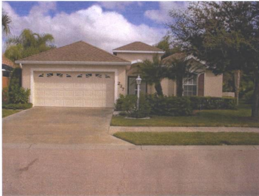
FRONT VIEW AT 237 VENICE PALMS BLVD., VENICE, FL 34292

If using the Elevation Certificate to obtain NFIP flood insurance, affix at least two building photographs below according to the instructions for Item A6. Identify all photographs with: date taken; "Front View" and "Rear View"; and, if required, "Right Side View" and "Left Side View." If submitting more photographs than will fit on this page, use the Continuation Page, following.