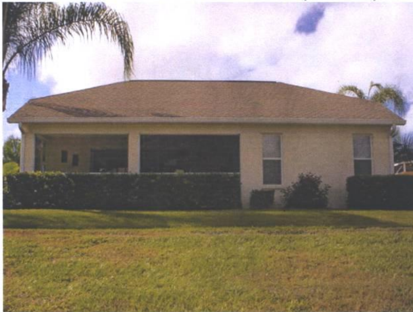
REAR VIEW AT 237 VENICE PALMS BLVD., VENICE, FL 34292