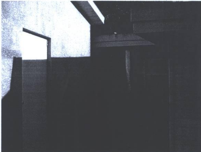
REAR VIEW OF THE NEW GARAGE AT 4824 VINSON AVE., SARASOTA, FL 34232