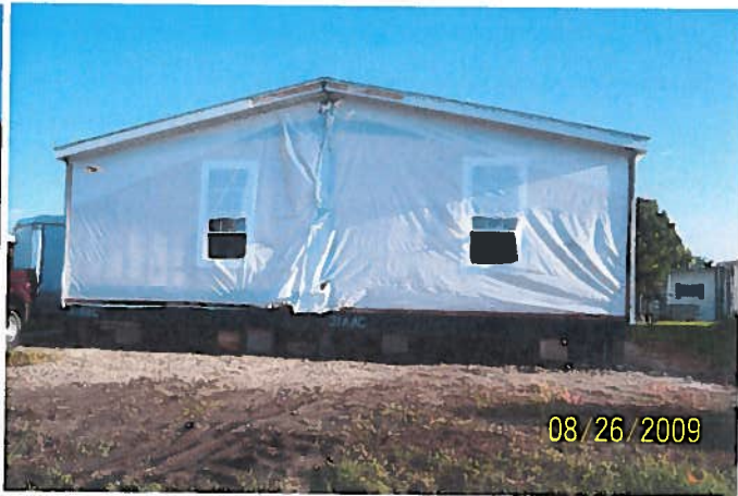
RIGHT VIEW 8/26/09