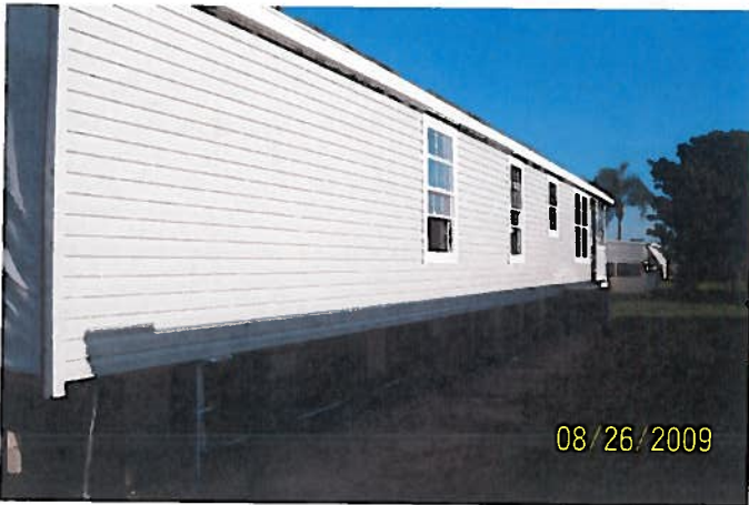
REAR VIEW 8/26/09