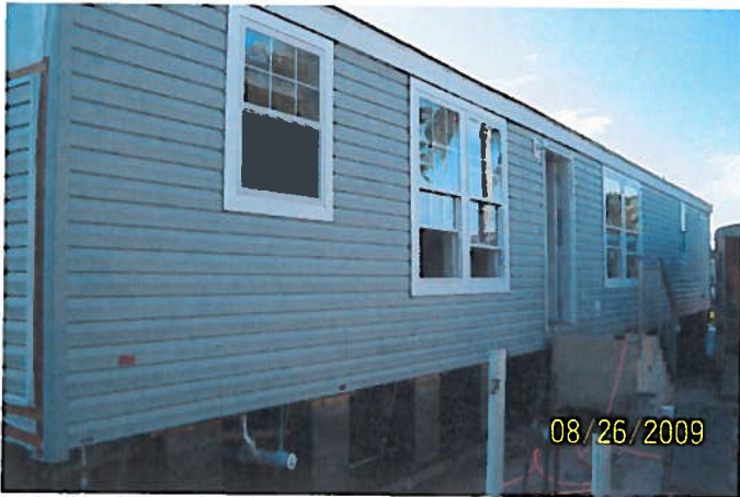
FRONT VIEW 8/26/09