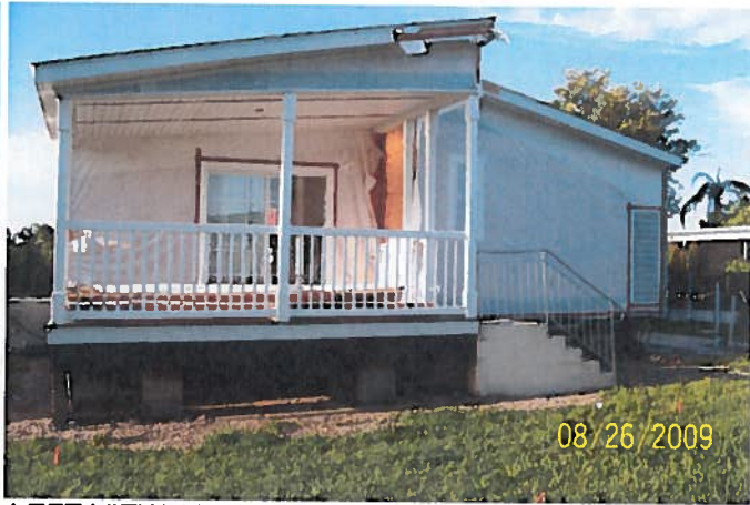
LEFT VIEW 8/26/09