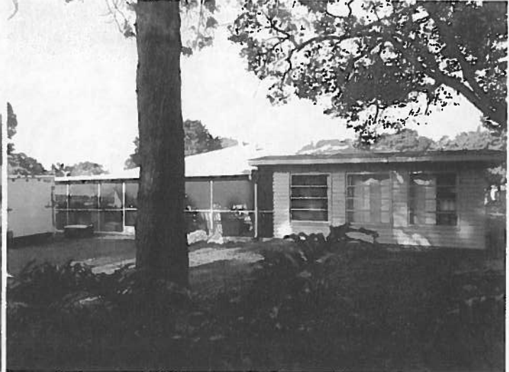
REAR VIEW 3/12/15