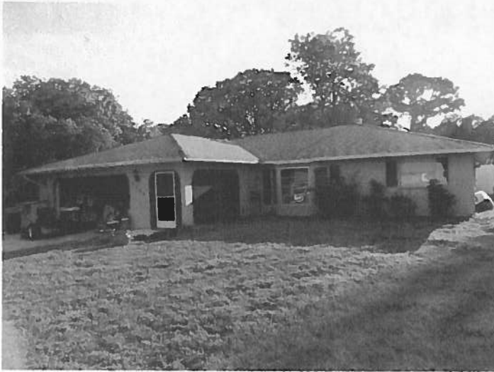
FRONT VIEW 3/12/15

If using the Elevation Certificate to obtain NFIP flood insurance, affix at least 2 building photographs below according to the instructions for Item A6. Identify all photographs with date taken; "Front View" and "Rear View"; and, if required, "Right Side View" and "Left Side View." When applicable, photographs must show the foundation with representative examples of the flood openings or vents, as indicated in Section A8. If submitting more photographs than will fit on this page, use the Continuation Page.