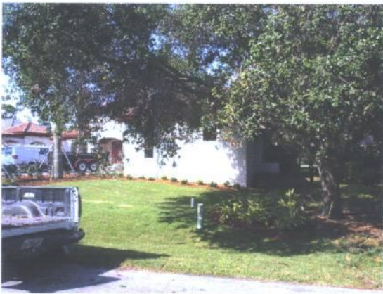
5/18/07 - Front View