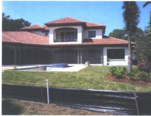
5/18/07 - Rear View