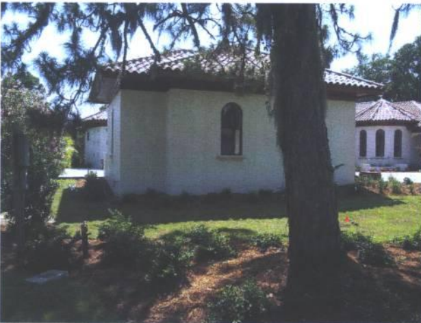
5/18/07 - Left Side View