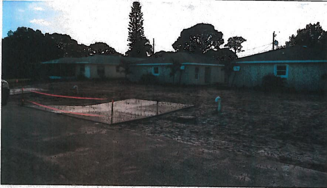
FRONT VIEW 11/08/16

If using the Elevation Certificate to obtain NFIP flood insurance, affix at least 2 building photographs below according to the instructions for Item A6. Identify all photographs with date taken; "Front View" and "Rear View"; and, if required, "Right Side View" and "Left Side View." When applicable, photographs must show the foundation with representative examples of the flood openings or vents, as indicated in Section A8. If submitting more photographs than will fit on this page, use the Continuation Page.