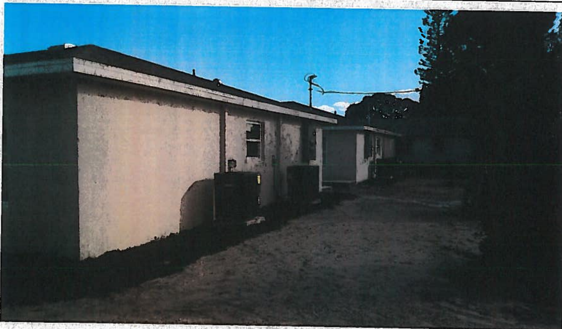
REAR VIEW 11/08/16