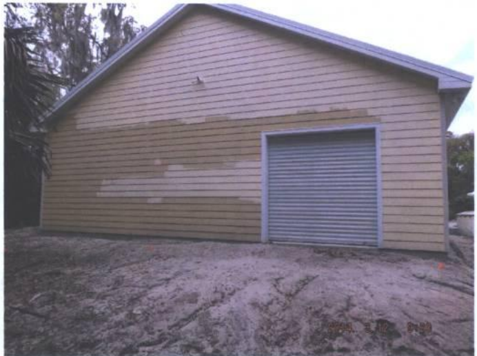
REAR VIEW 3-12-14