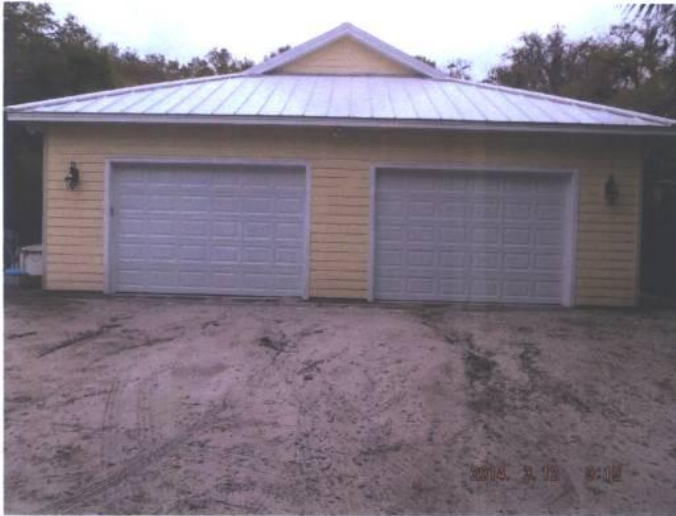
FRONT VIEW 3-12-14

If using the Elevation Certificate to obtain NFIP flood insurance, affix at least 2 building photographs below according to the instructions for Item A6. Identify all photographs with date taken; "Front View" and "Rear View"; and, if required, "Right Side View" and "Left Side View." When applicable, photographs must show the foundation with representative examples of the flood openings or vents, as indicated in Section A8. If submitting more photographs than will fit on this page, use the Continuation Page.