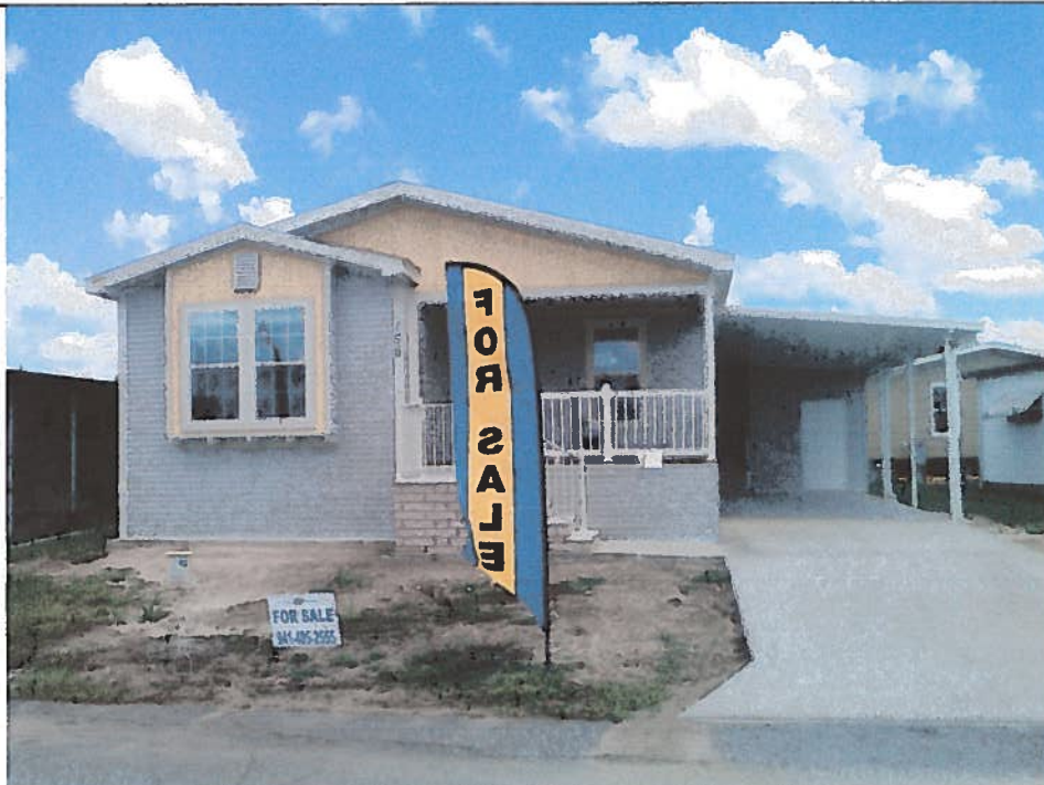
Photo One Caption Front

If using the Elevation Certificate to obtain NFIP flood insurance, affix at least 2 building photographs below according to the instructions for Item A6. Identify all photographs with date taken; "Front View" and "Rear View"; and, if required, "Right Side View" and "Left Side View." When applicable, photographs must show the foundation with representative examples of the flood openings or vents, as indicated in Section A8. If submitting more photographs than will fit on this page, use the Continuation Page.