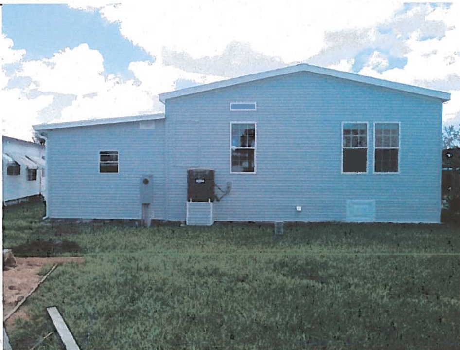
Photo Two Caption Rear