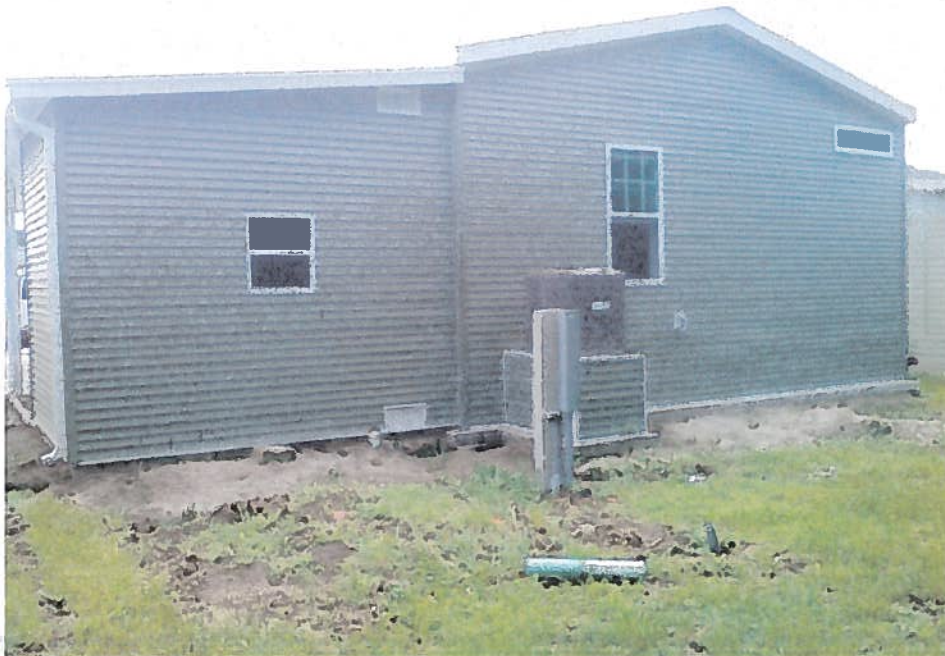
Photo Two Caption Rear