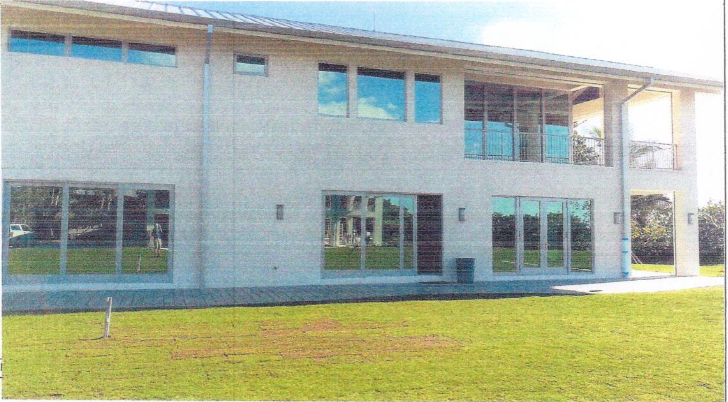
7960 SANDERLING ROAD - GUEST HOUSE FRONT PHOTO

If submitting more photographs than will fit on the preceding page, affix the additional photographs below. Identify all photographs with: date taken; "Front View" and "Rear View"; and, if required, "Right Side View" and "Left Side View." When applicable, photographs must show the foundation with representative examples of the flood openings or vents, as indicated in Section A8.