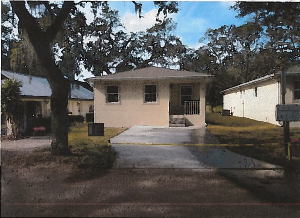
Photo One Caption FRONT

If using the Elevation Certificate to obtain NFIP flood insurance, affix at least 2 building photographs below according to the instructions for Item A6. Identify all photographs with date taken; "Front View" and "Rear View"; and, if required, "Right Side View" and "Left Side View." When applicable, photographs must show the foundation with representative examples of the flood openings or vents, as indicated in Section A8. If submitting more photographs than will fit on this page, use the Continuation Page.