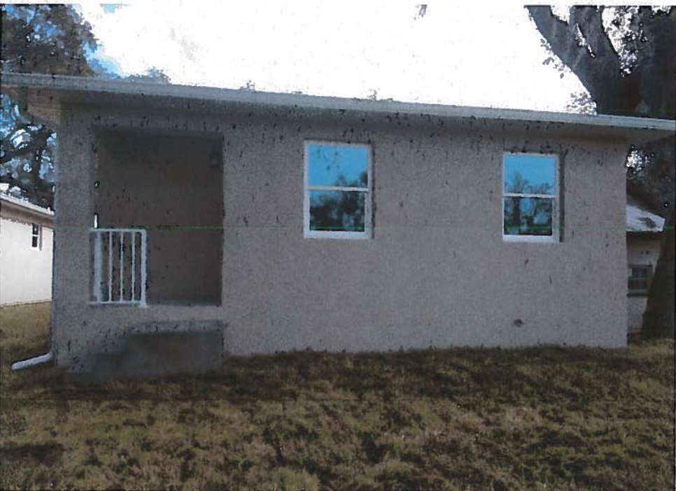
Photo Two Caption BACK