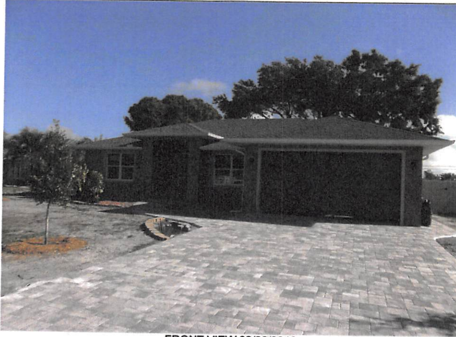
FRONT VIEW 02/26/2018

If using the Elevation Certificate to obtain NFIP flood insurance, affix at least 2 building photographs below according to the instructions for Item A6. Identify all photographs with date taken; "Front View" and "Rear View"; and, if required, "Right Side View" and "Left Side View." When applicable, photographs must show the foundation with representative examples of the flood openings or vents, as indicated in Section A8. If submitting more photographs than will fit on this page, use the Continuation Page.