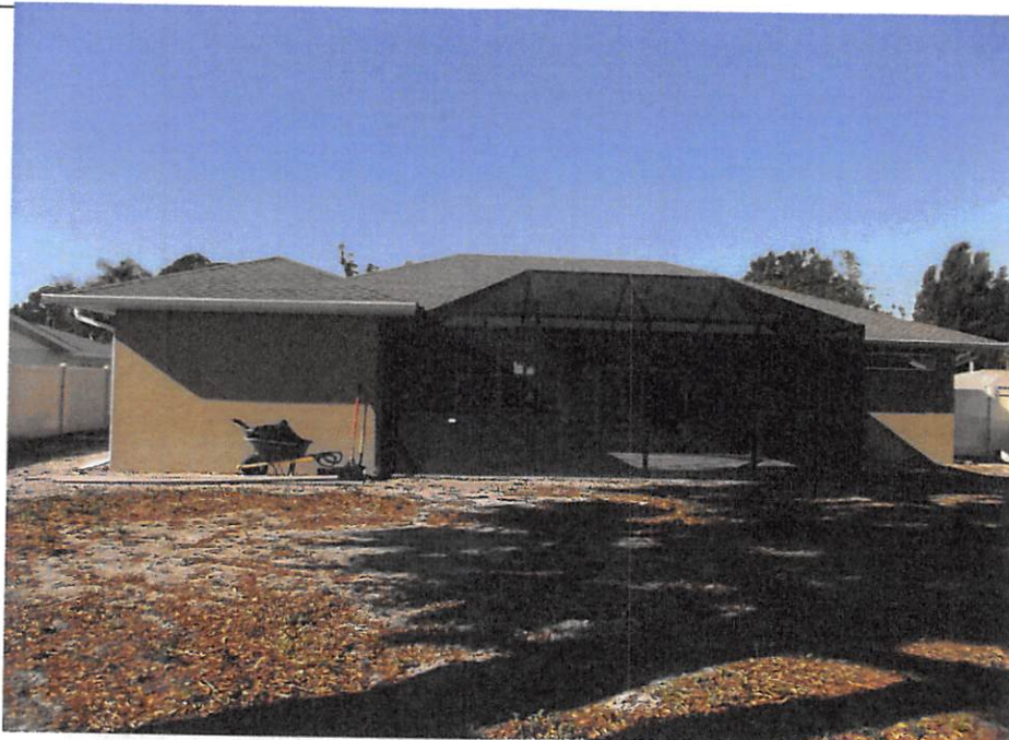
REAR VIEW 02/26/2018