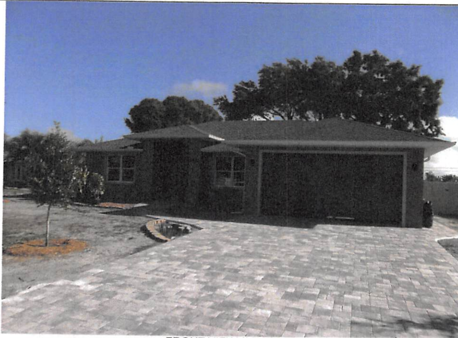
FRONT VIEW 02/26/2018

If using the Elevation Certificate to obtain NFIP flood insurance, affix at least 2 building photographs below according to the instructions for Item A6. Identify all photographs with date taken; "Front View" and "Rear View"; and, if required, "Right Side View" and "Left Side View." When applicable, photographs must show the foundation with representative examples of the flood openings or vents, as indicated in Section A8. If submitting more photographs than will fit on this page, use the Continuation Page.