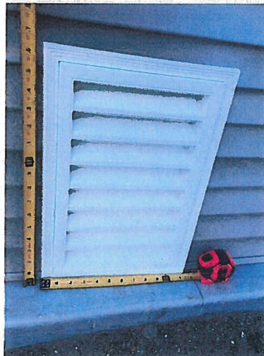
Photo Two Caption Flow through vent in Stroage area Date Taken 01/04/18 JOB# 15-1022