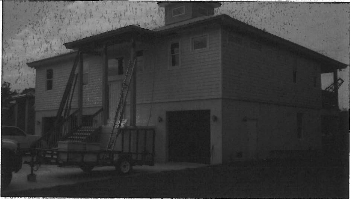
FRONT VIEW 03/08/2018

If using the Elevation Certificate to obtain NFIP flood insurance, affix at least 2 building photographs below according to the instructions for Item A6. Identify all photographs with date taken; "Front View" and "Rear View"; and, if required, "Right Side View" and "Left Side View." When applicable, photographs must show the foundation with representative examples of the flood openings or vents, as indicated in Section A8. If submitting more photographs than will fit on this page, use the Continuation Page.