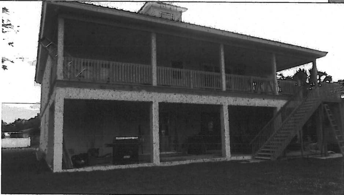
REAR VIEW 03/08/2018