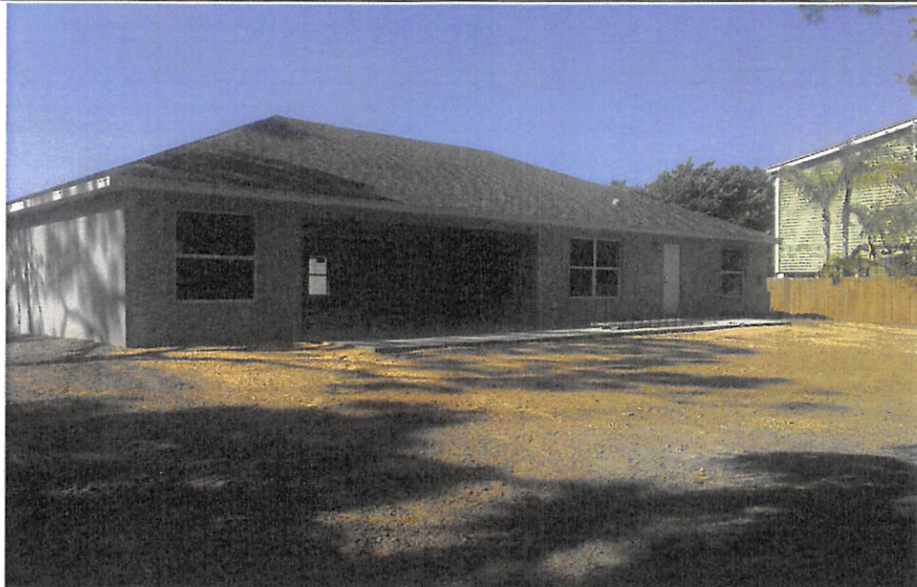
REAR VIEW 03/29/2018