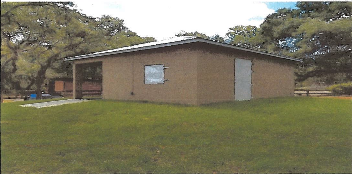
Photo Two Caption 5833 Old Ranch Road - BARN