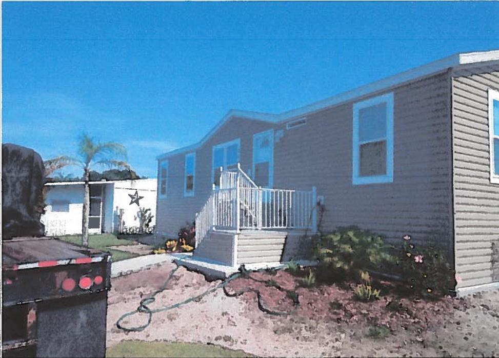
Photo One Caption FRONT

If using the Elevation Certificate to obtain NFIP flood insurance, affix at least 2 building photographs below according to the instructions for Item A6. Identify all photographs with date taken; "Front View" and "Rear View"; and, if required, "Right Side View" and "Left Side View." When applicable, photographs must show the foundation with representative examples of the flood openings or vents, as indicated in Section A8. If submitting more photographs than will fit on this page, use the Continuation Page.