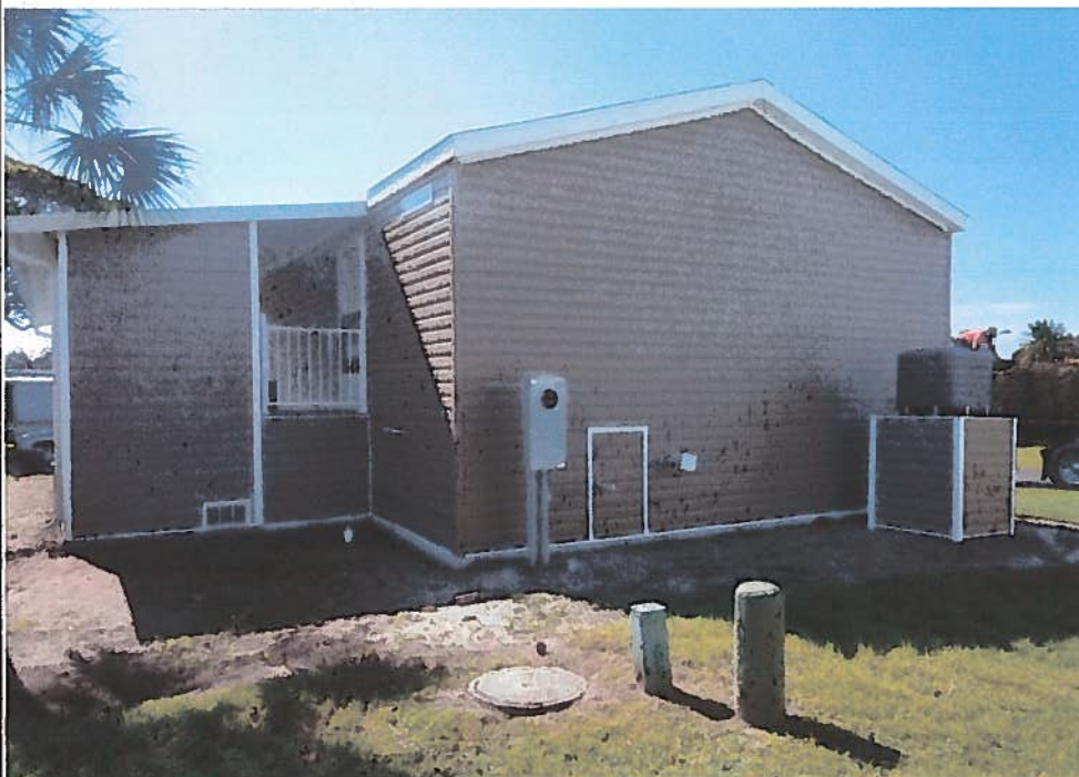
Photo Two Caption BACK