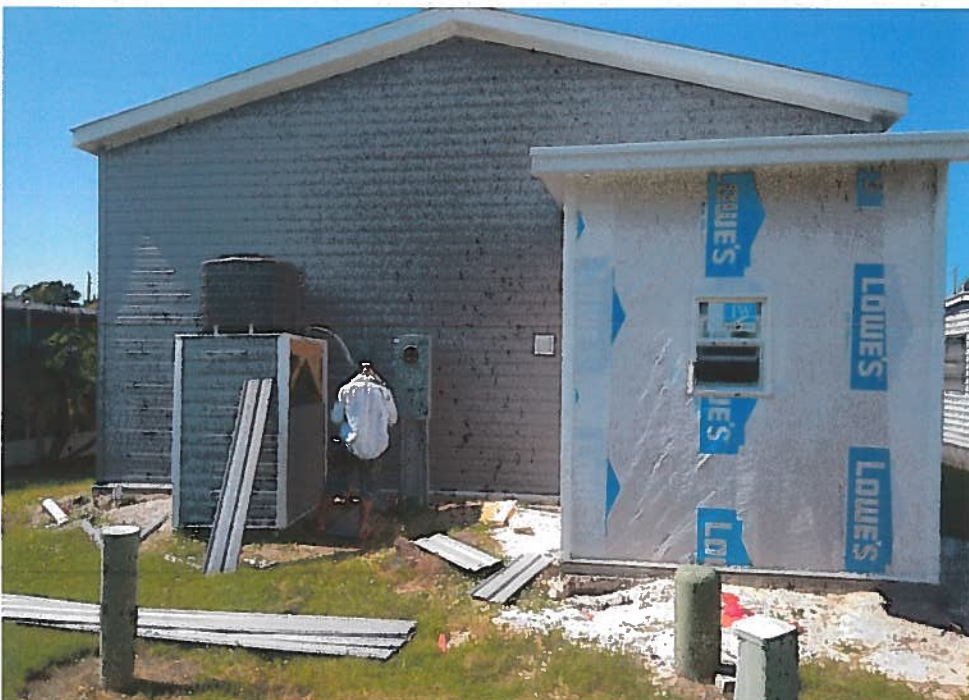
Photo Two Caption BACK