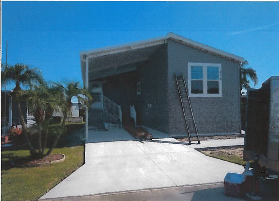
Photo One Caption FRONT

If using the Elevation Certificate to obtain NFIP flood insurance, affix at least 2 building photographs below according to the instructions for Item A6. Identify all photographs with date taken; "Front View" and "Rear View"; and, if required, "Right Side View" and "Left Side View." When applicable, photographs must show the foundation with representative examples of the flood openings or vents, as indicated in Section A8. If submitting more photographs than will fit on this page, use the Continuation Page.