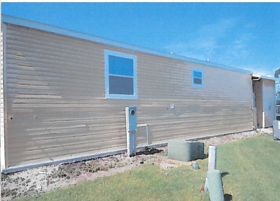
Photo Two Caption BACK