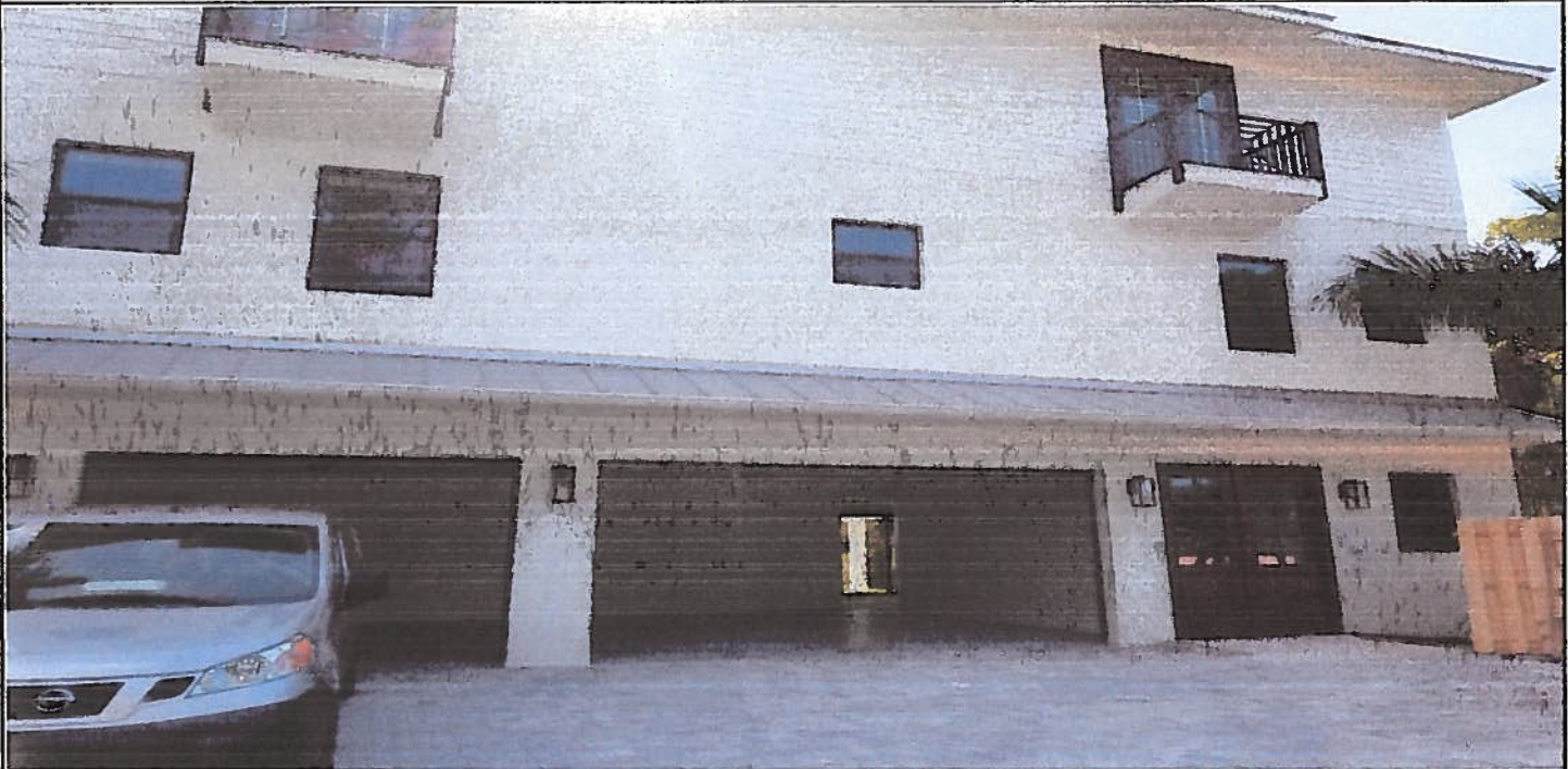
Photo One Caption 8201 Midnight Pass Road - Front Photo

If submitting more photographs than will fit on the preceding page, affix the additional photographs below. Identify all photographs with: date taken; "Front View" and "Rear View"; and, if required, "Right Side View" and "Left Side View." When applicable, photographs must show the foundation with representative examples of the flood openings or vents, as indicated in Section A8.