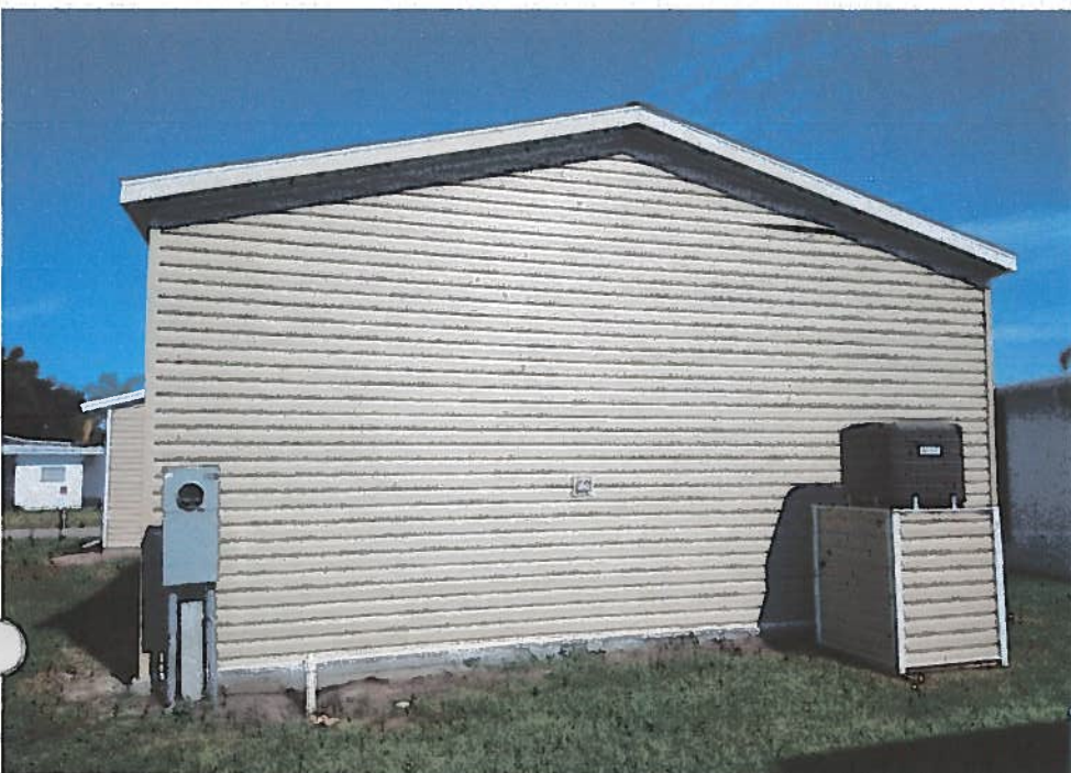
Photo Two Caption BACK