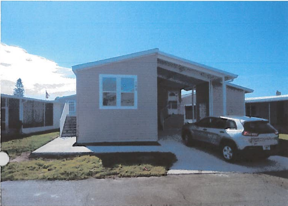
Photo One Caption FRONT

If using the Elevation Certificate to obtain NFIP flood insurance, affix at least 2 building photographs below according to the instructions for Item A6. Identify all photographs with date taken; "Front View" and "Rear View"; and, if required, "Right Side View" and "Left Side View." When applicable, photographs must show the foundation with representative examples of the flood openings or vents, as indicated in Section A8. If submitting more photographs than will fit on this page, use the Continuation Page.